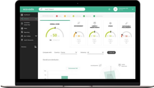
Download a sample CSR Scorecard here

Best of all, you can share the results of the assessment (your scorecard) with multiple customers and save a lot of time and effort.