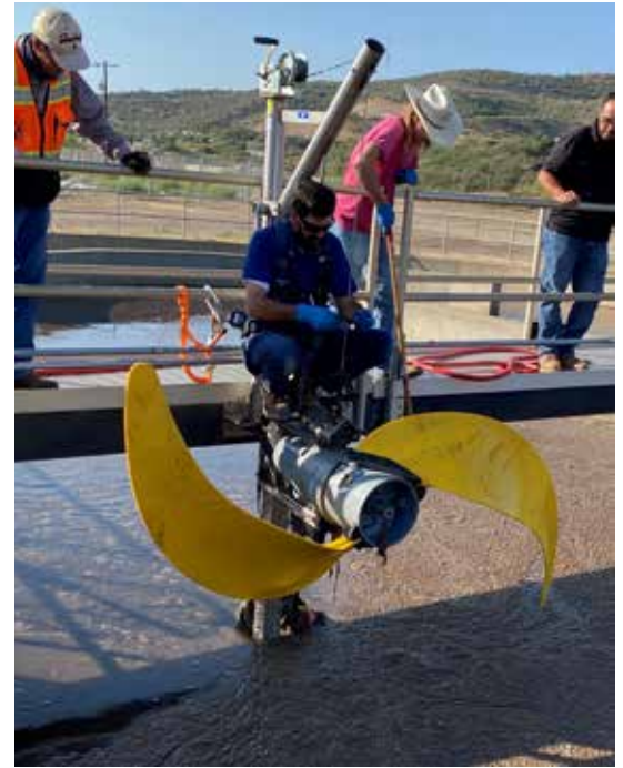
The Pinal Creek Wastewater Treatment Facility has seen a 50% reduction in energy use since project completion.

Xylem, Inc. 4828 Parkway Plaza Blvd., Suite 200 Charlotte, NC 28217 Tel 704.409.9700 Fax 704.295.9080 855-XYL-H2O1 (855-995-4261) www.xylem.com