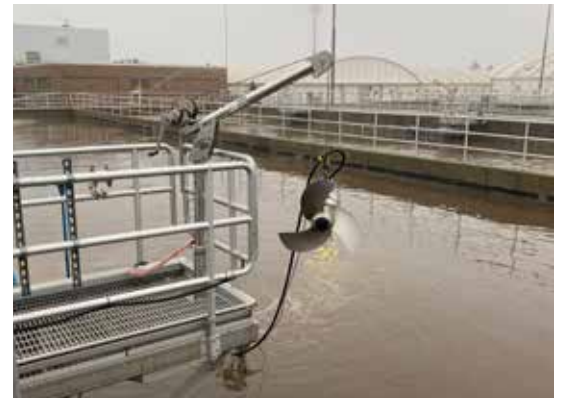
The Flygt adaptive mixers proved to be a reliable, efficient solution for the LCPW. Since installation, the mixers have performed flawlessly.

Xylem, Inc. 4828 Parkway Plaza Blvd., Suite 200 Charlotte, NC 28217 Tel 704.409.9700 Fax 704.295.9080 855-XYL-H2O1 (855-995-4261) www.xylem.com