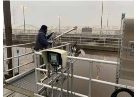
A facility operator pulls a Flygt 4220 adaptive mixer for inspection.