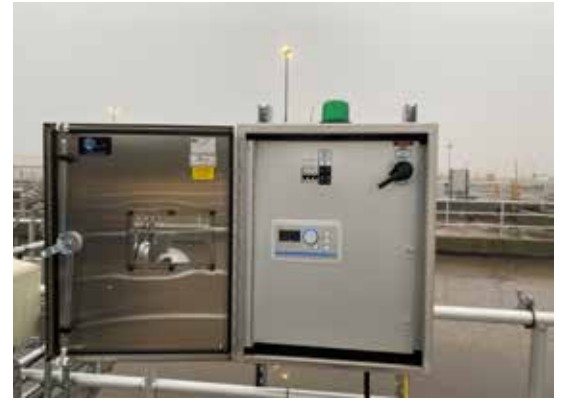
Integrated advanced controls allow the adjustment of thrust and energy consumption to adapt to process changes as well as providing continuous communication with the operator.

"Most importantly, the Flygt mixers work," said Grinnell. "We have seen big energy savings."