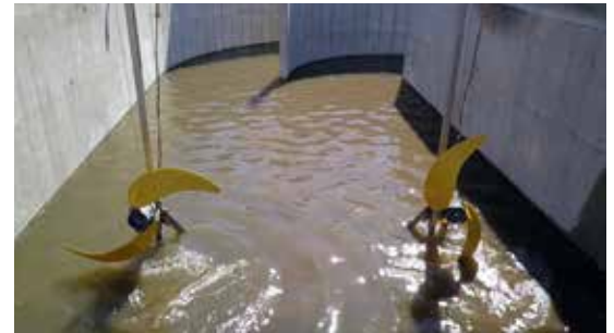
Two Flygt adaptive mixers regulate channel velocity, reduce air requirements, and keep particles in suspension.

As part of the upgrades, the city sought to replace its jet aerators to improve aeration and energy efficiency. The complete solution provided by JCH and Xylem, includes a Sanitaire Bioloop oxidation ditch that uses dedicated Flygt adaptive mixers and Sanitaire aeration to provide flexibility and energy efficiencies that traditional mechanical aeration/mixing systems can't match.