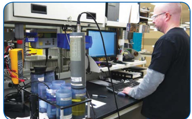
Verification that sensors meet YSI specifications

If additional services apply, they will be quoted at time of service