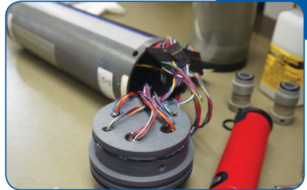
Comprehensive inspection and testing by expert technicians