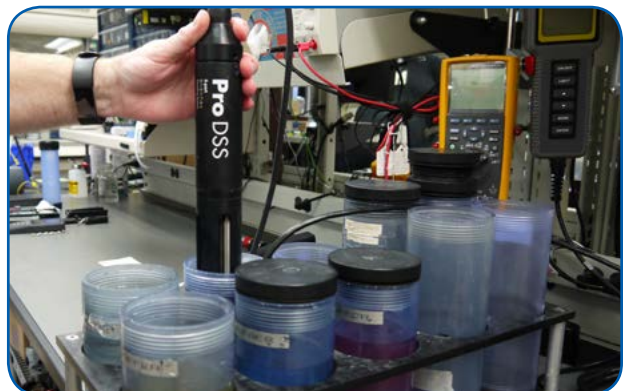
Verification that sensors meet YSI specifications