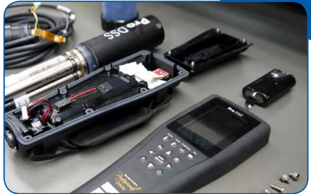
Comprehensive inspection and testing by expert technicians