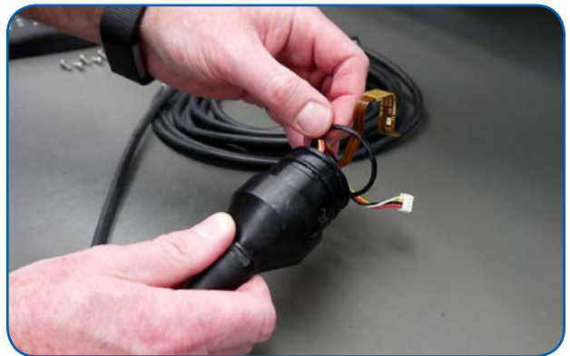
Cable/probe assembly seal replacement

10% DISCOUNT ON ANY NEEDED REPLACEMENT PARTS