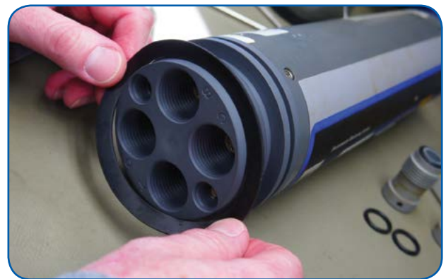
Bulkhead seal replacement

Quad Seal Replacement .... $120.00 (per optical probe)