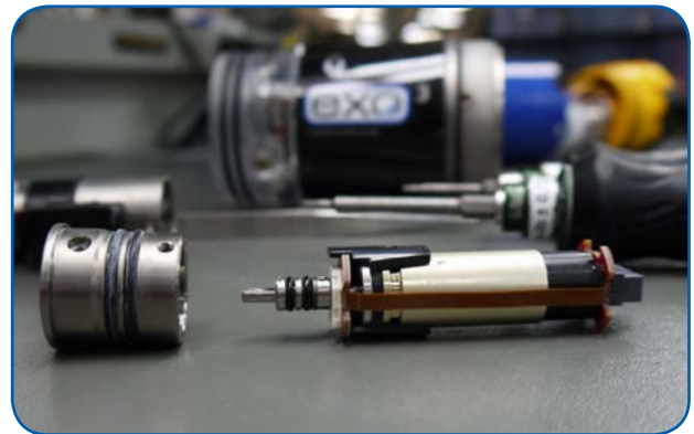
Annual Wiper service is critical to anti-fouling protection