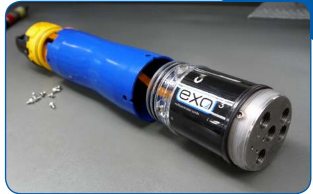
Comprehensive inspection and seal restoration by expert technicians

If additional services apply, they will be quoted at time of service