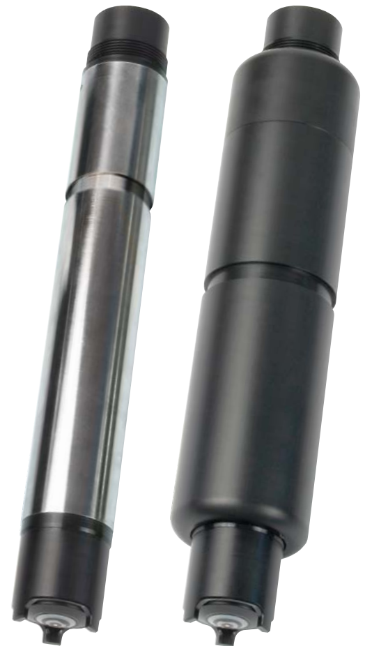
top left: TriOxmatic® 700 IQ; top right: seawater model TriOxmatic® 700 IQ SW