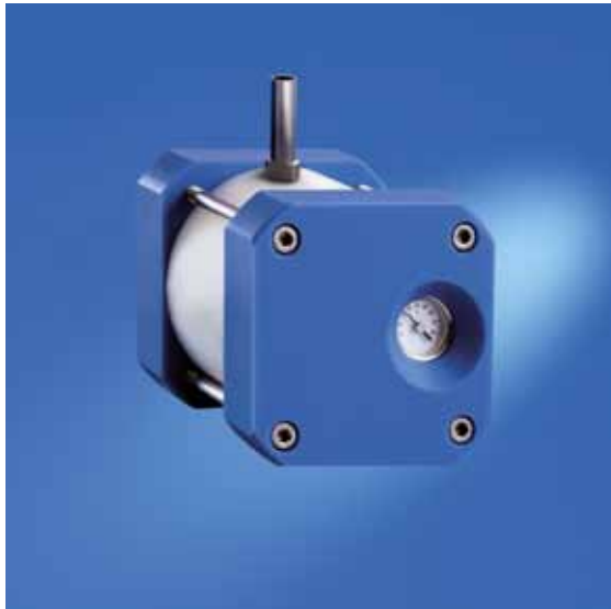
The electrolysis cell - core of the Wedeco WEL ozone system

WEDECO WEL ozone generators produce, by means of a specially developed electrolysis cell, ozone continuously in the water flow. The core of the electrolysis cell consists of an anode/cathode and a polymer solid electrolyte membrane, which operates as a none dissolvable electrolyte and a separator in the cell. The electrolysis process between anode and cathode causes the production of ultra pure ozone in the water. At the same time the ozone is dissolved in the process water. It can perfectly be combined with WEDECO pure water UV-systems type E/ME or LBT. The ozone performance can be adjusted continuously between 0% and 100%.