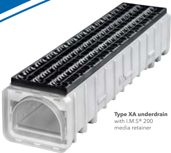
Type XA underdrain with I.M.S® 200 media retainer