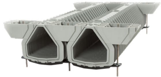
Type 360 Underdrain with hold-down brackets, anchor rods and support saddles