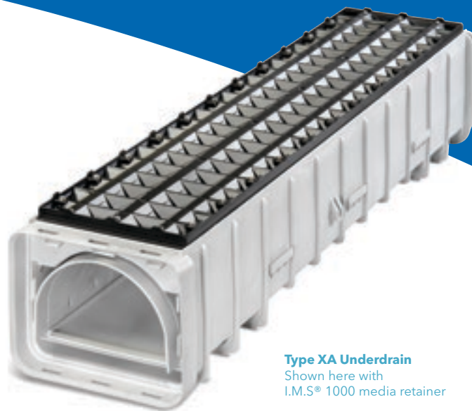
Type XA Underdrain Shown here with I.M.S® 1000 media retainer