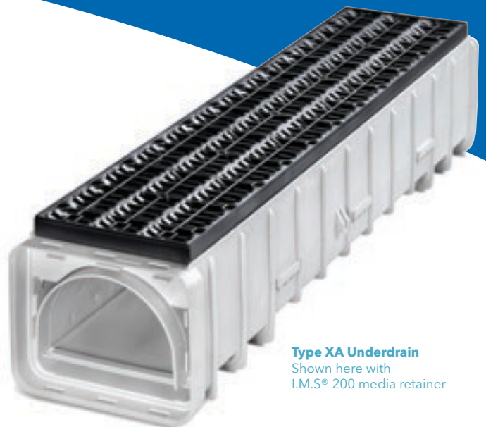
Type XA Underdrain Shown here with I.M.S.® 200 media retainer