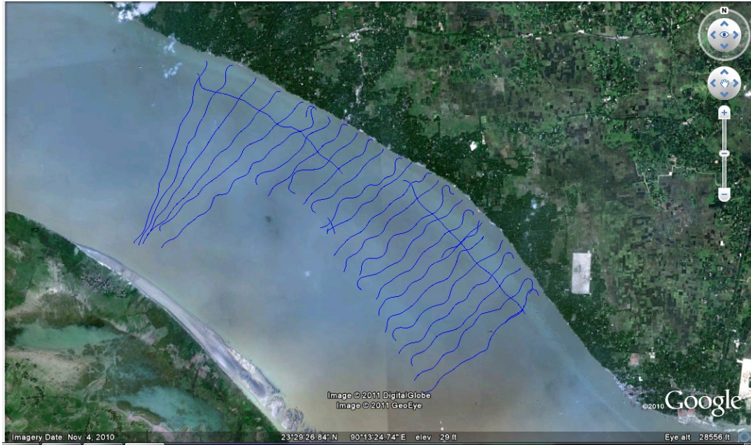
FIGURE 2. Sample Track Lines Exported to Google Earth™