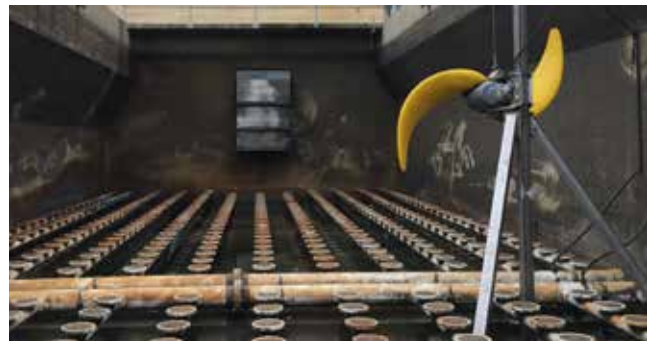
At the Milwaukee facility, the Flygt 4320 mixer was positioned in the formerly aerobic section of the basin to provide the best use of produced thrust.

These design stage uncertainties do not have to be big factors in variable thrust mixing, because it provides the engineer more flexibility right up to the time all facts are known with (typically when the mixer is commissioned), having the ability after installation to change mixer thrust to meet the facility's specific conditions can save energy cost significantly -- sometimes more than 50 percent, or thousands of pounds per mixer. This flexibility also allows a treatment plant to use only the energy the process requires today, while remaining well prepared for future increases in demand.