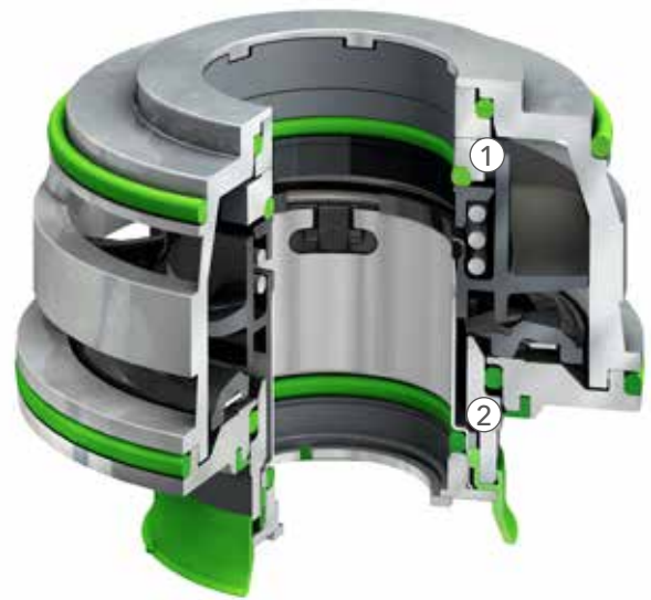
Plug-in Seal with the Active Seal system.

The new Plug-In Seals™ with the Active Seal system are completely interchangeable with previous generations of Plug-In Seals. The new inner seal with the Active Seal function is also interchangeable with old inner seals for many Flygt double seal systems with separate single seals.