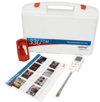
FOM 330-4-Set including hand protection and carrying case