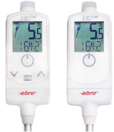
FOM 330-4 and FOM 330-1

In addition to the manual, the scope of delivery includes illustrated step-by-step-instructions, as well as a certificate of calibration for proof of the functionality of your device.