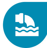
Sewage Treatment Plants