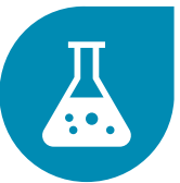
Aeration Blowers for Wastewater Treatment