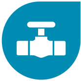
Wastewater or Stormwater Pumping Stations